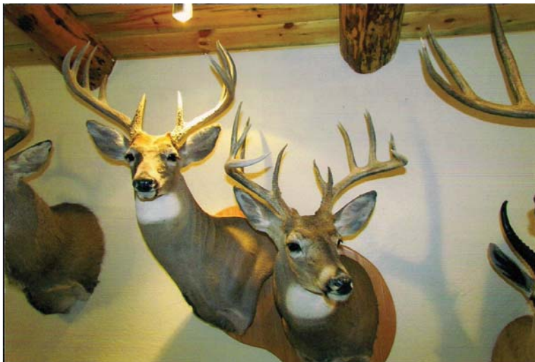
Both bucks mounted on a plaque in Rick's trophy room.

In hind sight, it really wasn't much of an elk hunt. They were totally nocturnal and the only time we saw the elk was at four-thirty in the morning when they crossed the road in front of the truck heading up the mountain. We never did catch up, but every time I see those two bucks on my trophy room wall I think back on four very special days in late September when the moon, stars, and the universe all aligned and gave me the opportunity to take the two best bucks in my life.